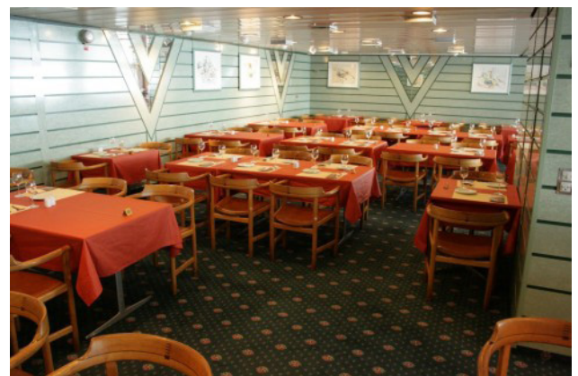
pp52 · pictures from the ferry in 2008 - after 30 years of everyday use