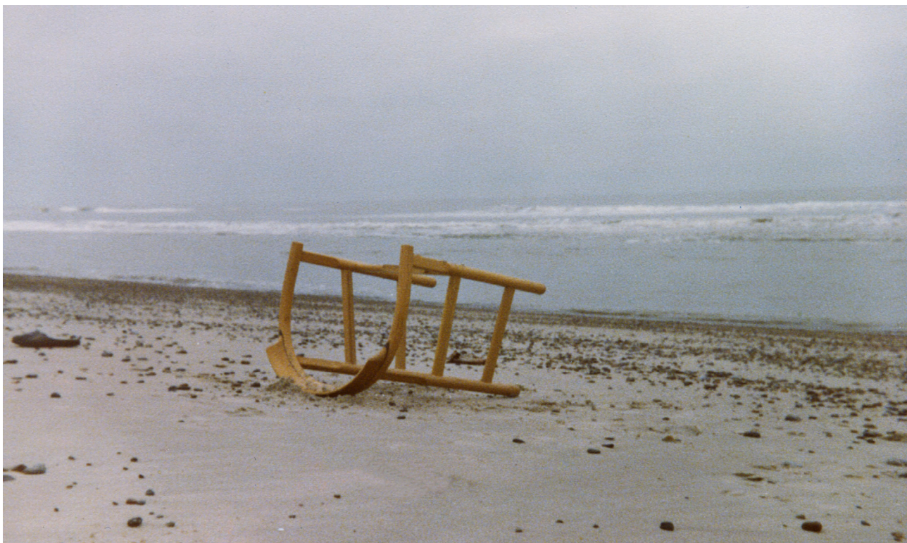
pp52 · as found on the beach of Vejers on the west coast of Denmark

The chair had been lost from the ferry at sea and been on it's own journey through the North Sea. The customer got a new seat - the chair it self was completely intact.