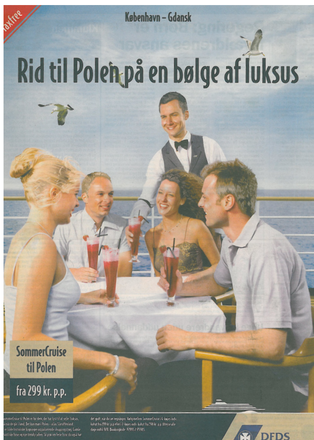
pp52 in an add for a ferry cruise placed in Danish newspapers in 2003. The add header says: "Ride to Poland on a wave of luxury" - after 25 years of everyday use

Now more than 30 years after the ferry's first journey, it has been re-named and upgraded several times and has sailed on a number of different routes in Denmark, United Kingdom, Holland, Poland, Norway and Sweden. But the chairs still remain on board!