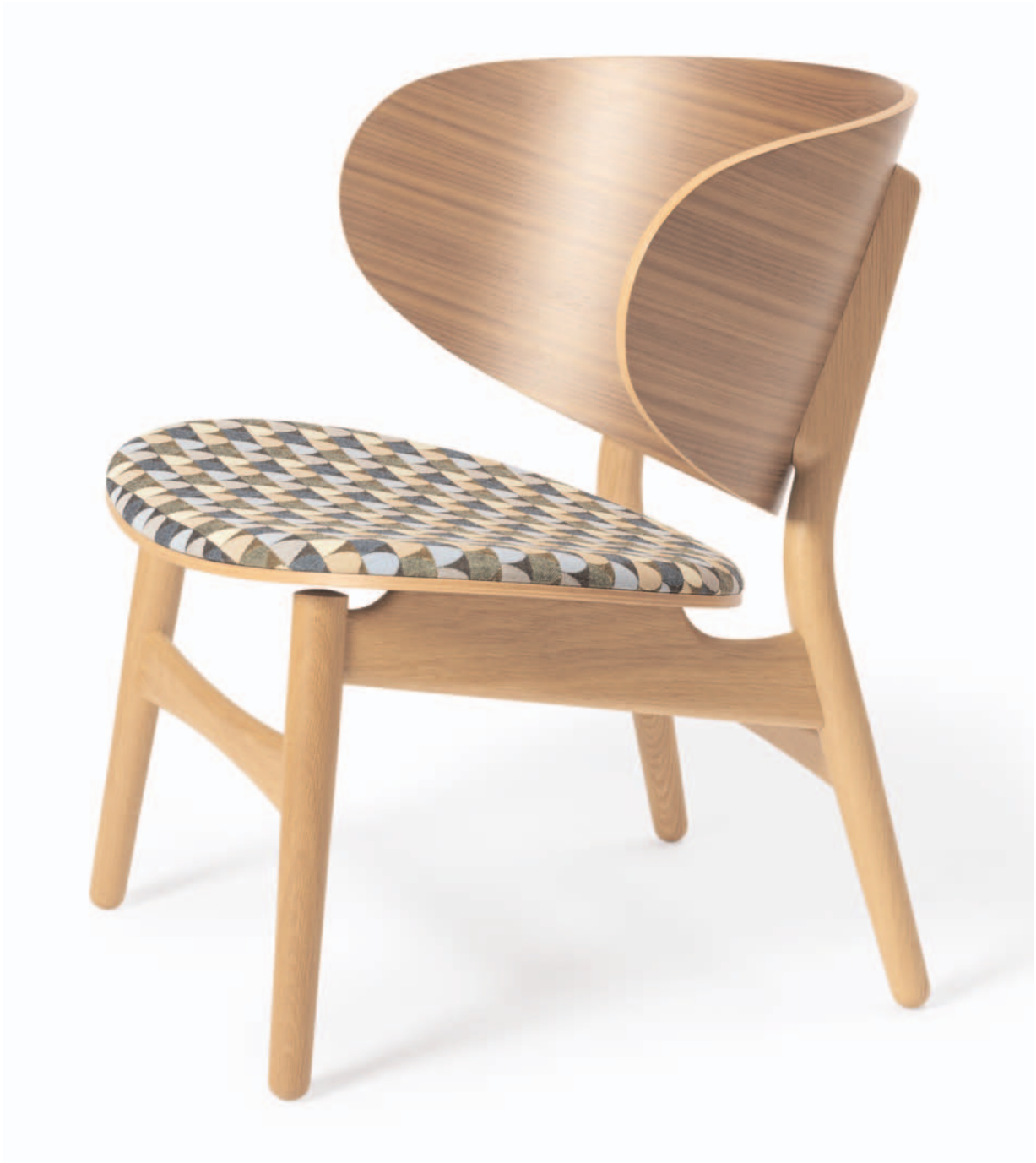
“Venus Chair” GE21935 Design Hans J. Wegner 1948