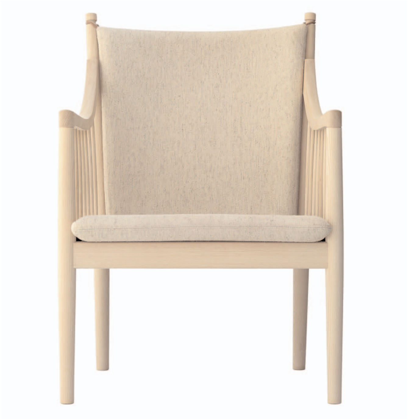
“Easy Chair” pp 105 Design Hans J. Wegner 1979