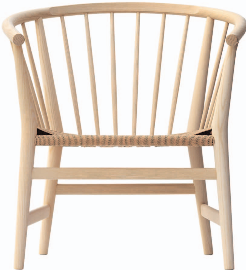
“The Newspaper Chair” pp 112 Design Hans J. Wegner 1978