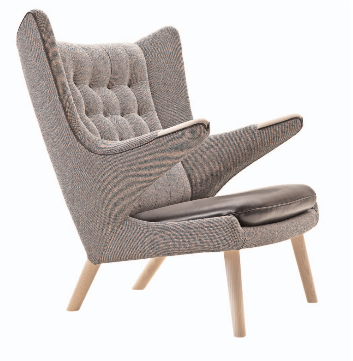
“Papa Bear Chair” pp 19 Design Hans J. Wegner 1951