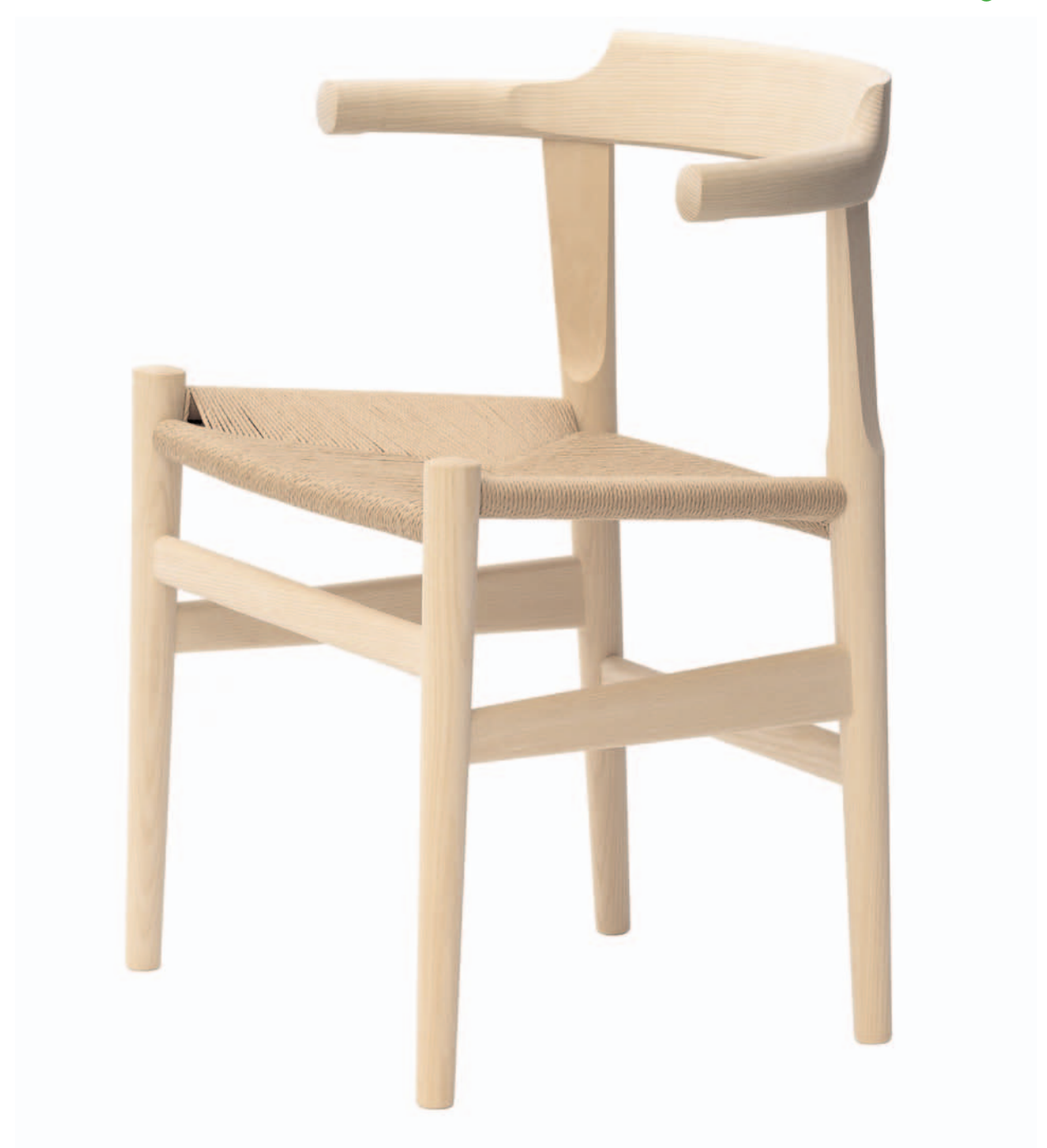
"Final Chair" pp 68 Design Hans J. Wegner 1987

The Old Dairy Tewin Hill Farm Hertforshire AL6 OLL Tel: 01707 324995 info@schiang.com