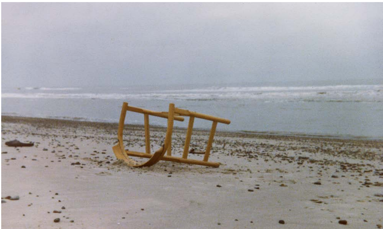
pp52 · as found on the beach of Vejers on the west coast of Denmark

The chair had been lost from the ferry at sea and been on it's own journey through the North Sea. The customer got a new seat - the chair it self was completely intact.