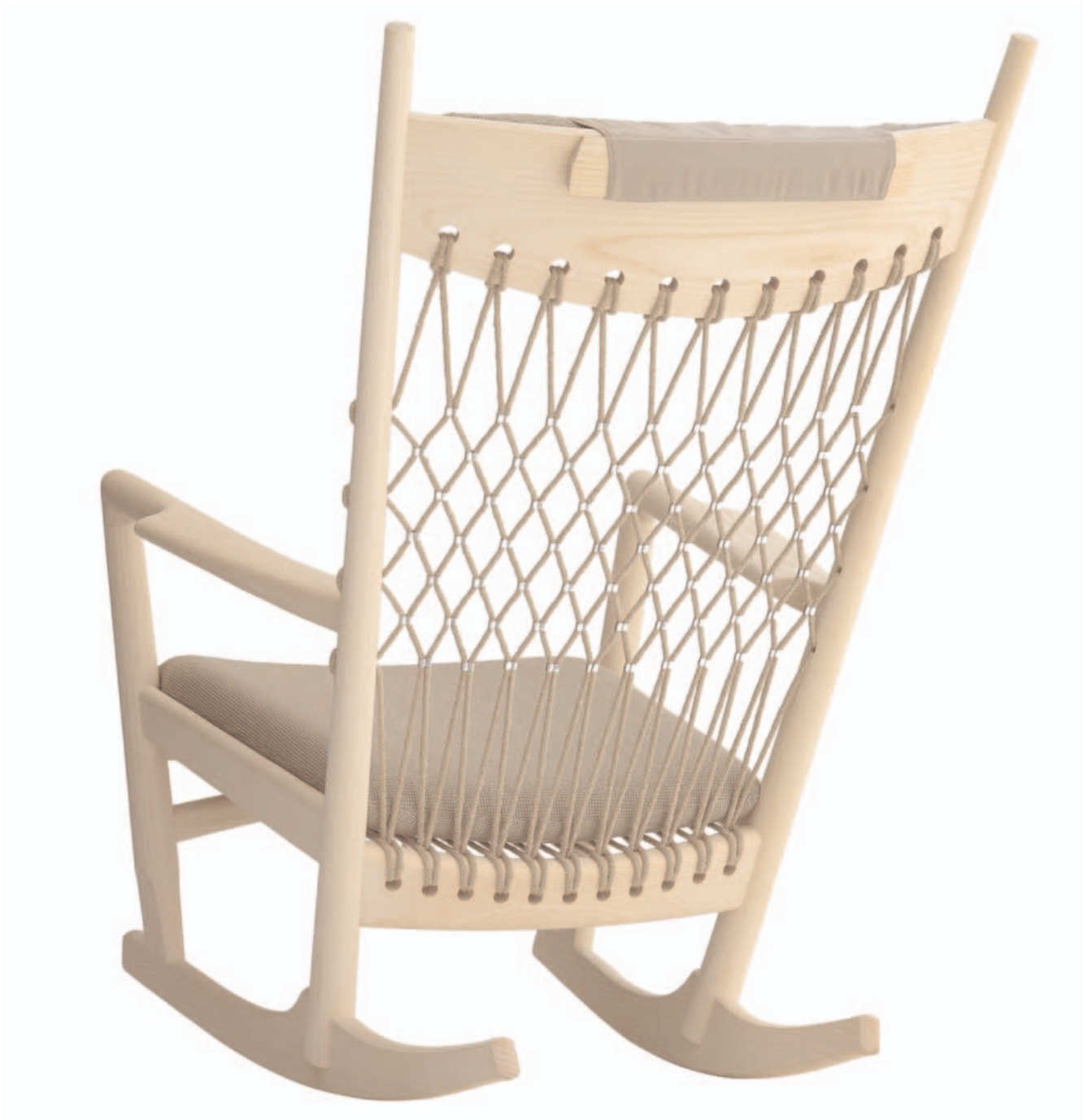
“Rocking Chair Chair” pp 124 Design Hans J. Wegner 1984