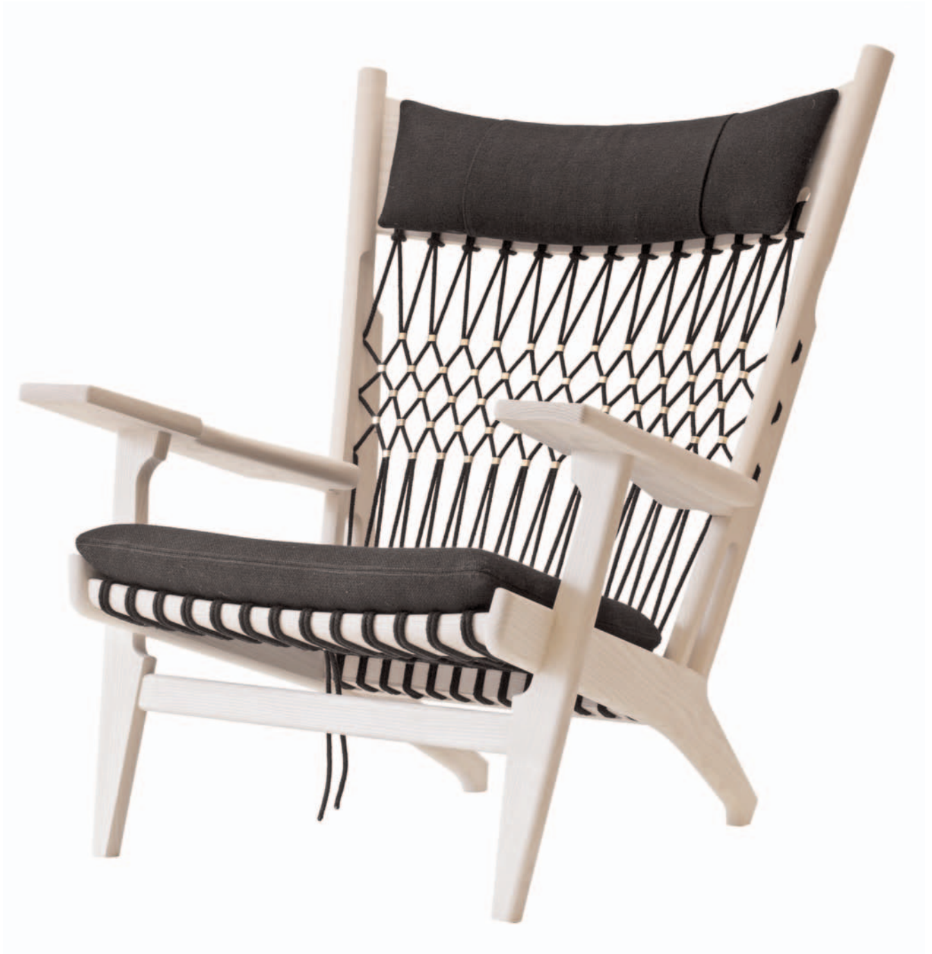
“Web Chair” pp 129 Design Hans J. Wegner 1968