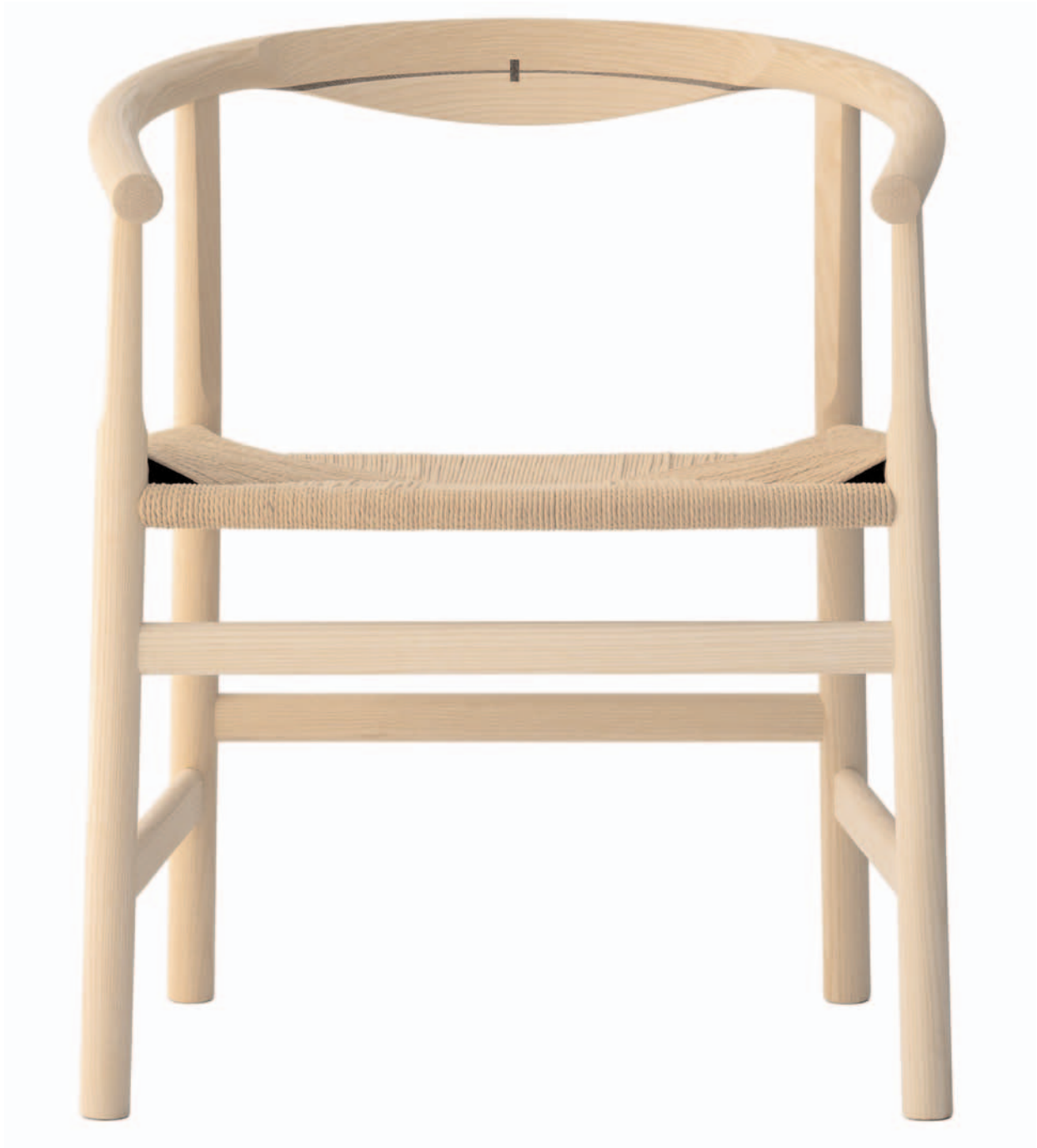
pp201 Design Hans J. Wegner 1969