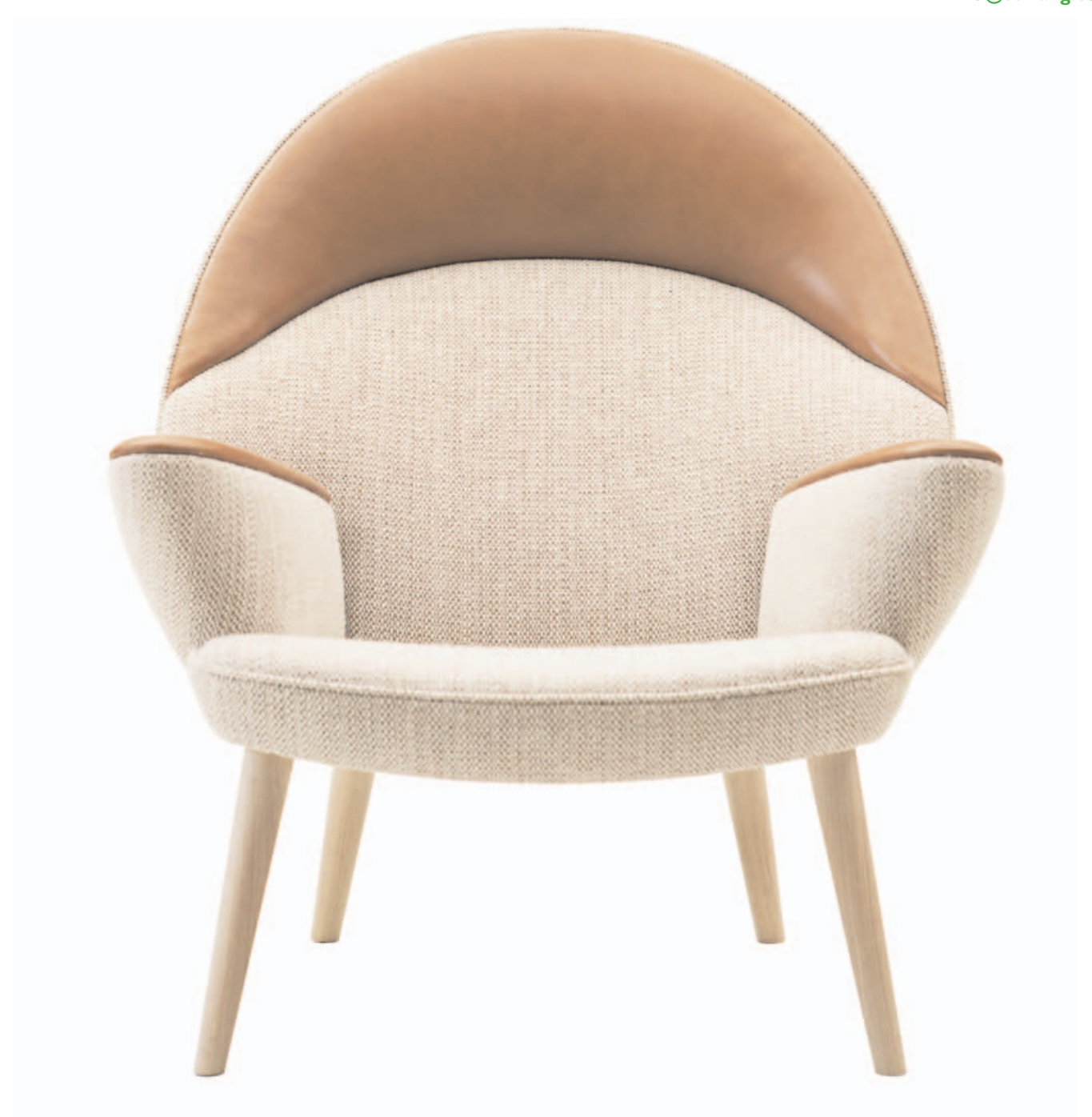
"The upholstered Peacock" pp 521 Design Hans J. Wegner 1954

The Old Dairy Tewin Hill Farm Hertforshire AL6 OLL Tel: 01707 324995 info@schiang.com