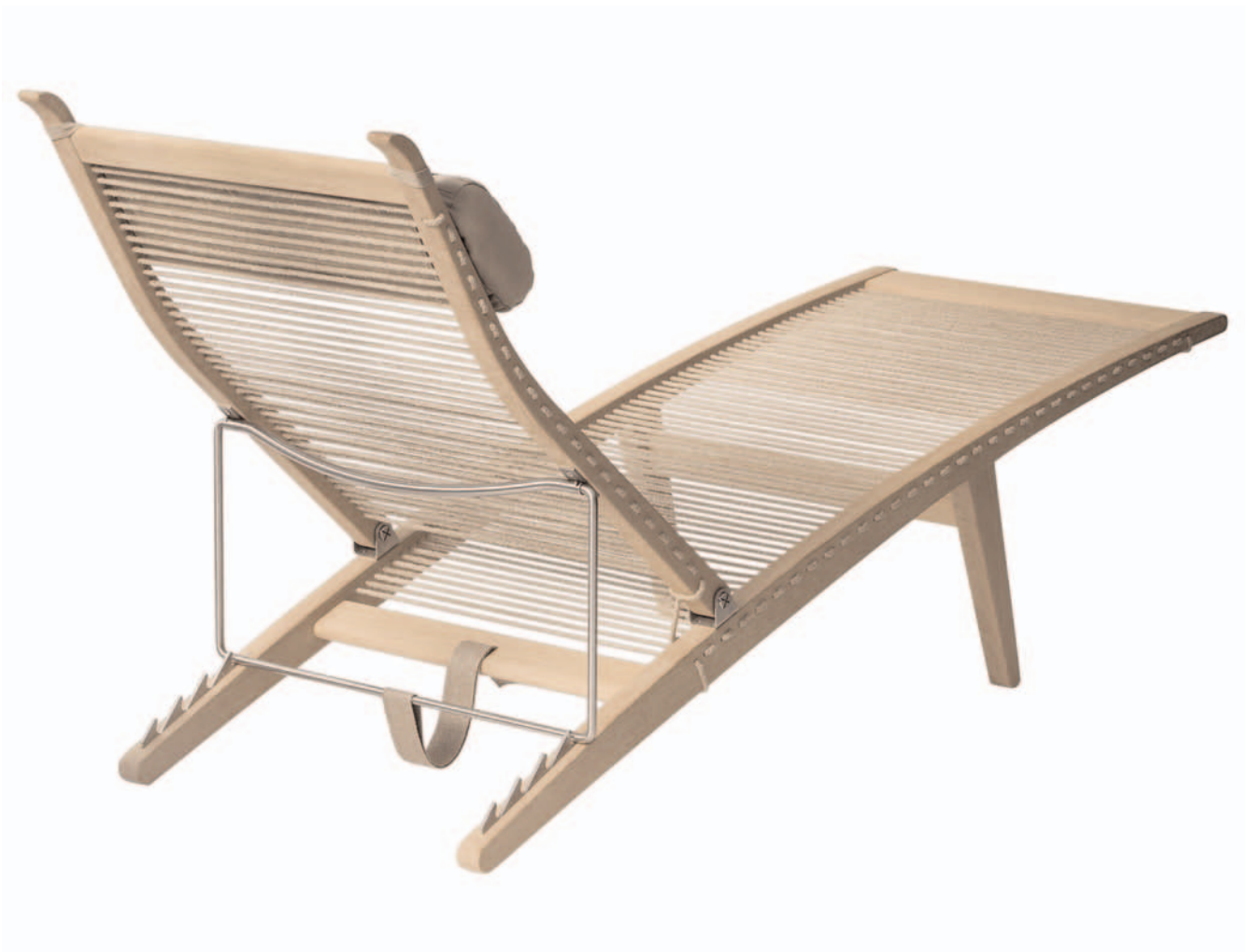
Deck Chair” pp 524 Design Hans J. Wegner 1958