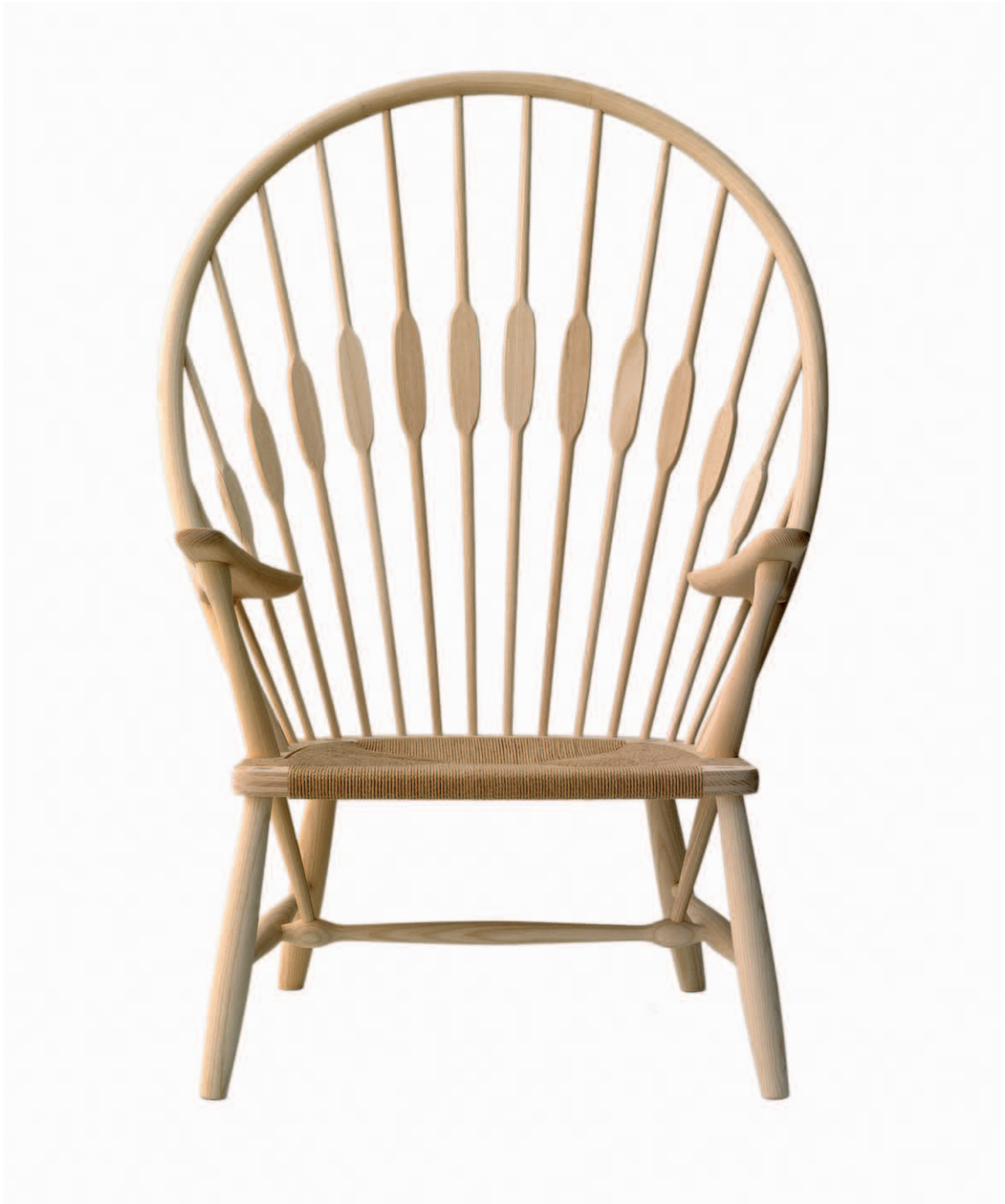
“Peacock Chair Chair” pp 550 Design Hans J. Wegner 1947