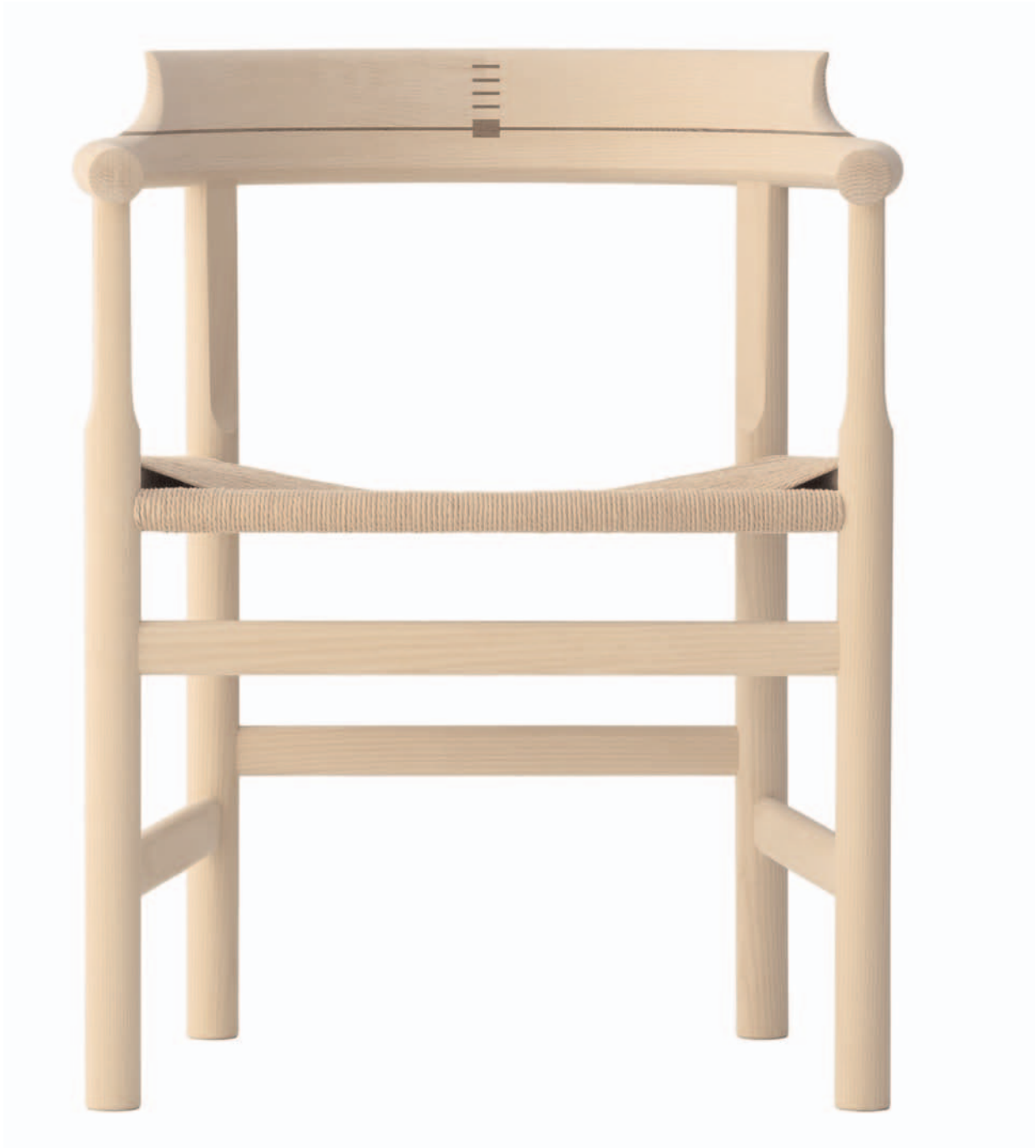
Ferry Chairs pp 62 / pp 52 Design Hans J. Wegner 1975